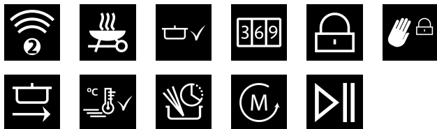
4132_NorCook IH N6326 BK